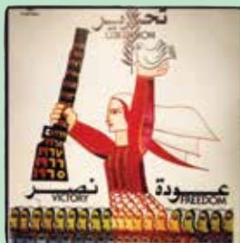
A Fatah poster from the 70s

Secondly, despite the extraordinary heroism of Hamas' fighters, who stand courageously against every Israeli assault in