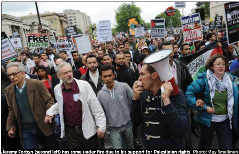
Jeremy Corbyn (second left) has come under fire due to his support for Palestinian rights

It calls on governments to impose sanctions on Israel, and on companies to disinvest from Israel and from any joint ventures with Israeli firms.