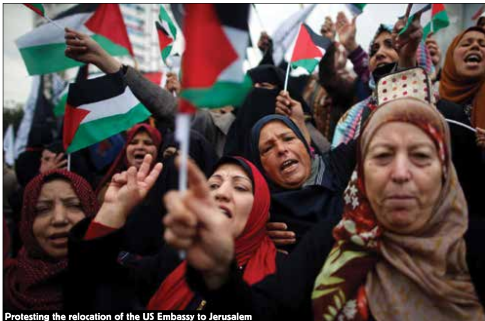
Protesting the relocation of the US Embassy to Jerusalem