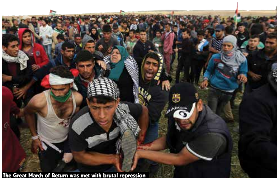
The Great March of Return was met with brutal repression

Should Fatah's leaders abandon the PA and the apparatus of power that the Oslo Accords created, or abandon resistance to Israel? They chose to abandon resistance, leaving the field of battle largely to Hamas.