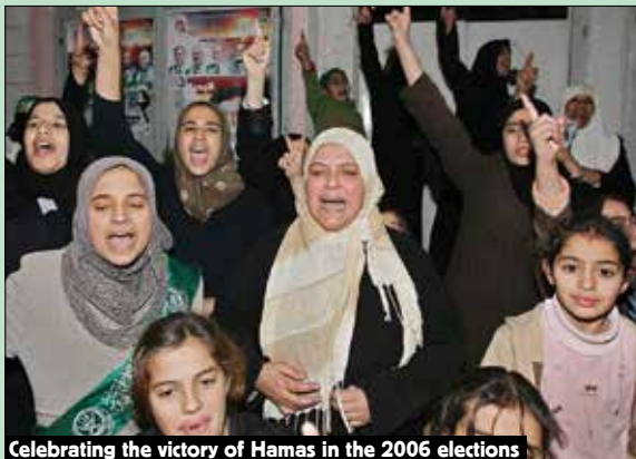
Celebrating the victory of Hamas in the 2006 elections

We consider that such movements necessarily serve the interests of the