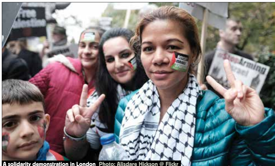
A solidarity demonstration in London