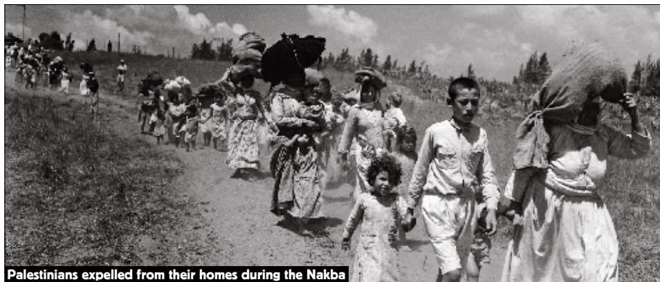
Palestinians expelled from their homes during the Nakba

The tragedy of Zionism lies in the decision by its leaders to become pioneers of European colonialism, rather than champions of the oppressed.