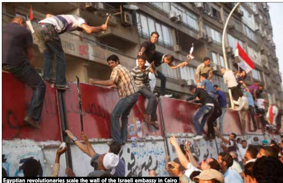
Egyptian revolutionaries scale the wall of the Israeli embassy in Cairo

in Egypt, providing massive financial support for the military regime which overthrew president Mohamed Morsi in 2013, and which carried out horrific massacres of Muslim Brotherhood members and supporters in August that year.