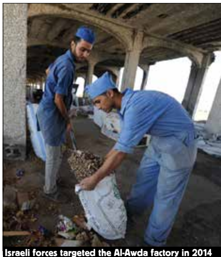
Israeli forces targeted the Al-Awda factory in 2014

The Oslo Accords reshaped the economy of the Occupied Territories to the benefit of Israel. It created the mechanisms by which Palestinian institutions would become active partners in the process of integrating the West Bank and Gaza into the Israeli economy.